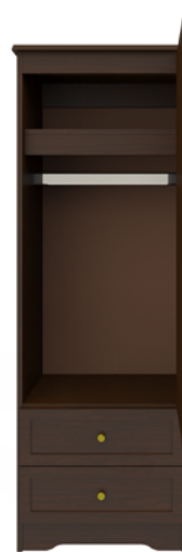
Model: MIWR21R 25W 23.75D 71H

Time-honored crafting and practical concerns blend to produce refined, functional furniture. OG edging and gently radiused corners add understated touches of distinction to these water- and scuff-resistant, fire-retardant products. Choose from dozens of hardware styles, including ADA-compliant. The product is required to be wall mounted for safety. Using the kit provided, please follow provided instructions exactly.